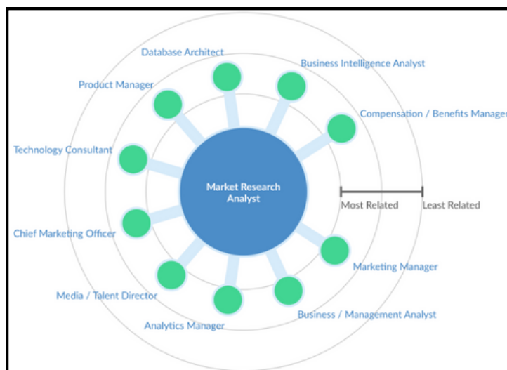
Related Jobs– Career Pathways Report